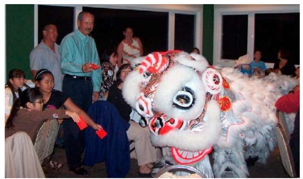
10th Anniversary attendees were delighted by the Lion Dance opening to kick off the festivities on January 16.